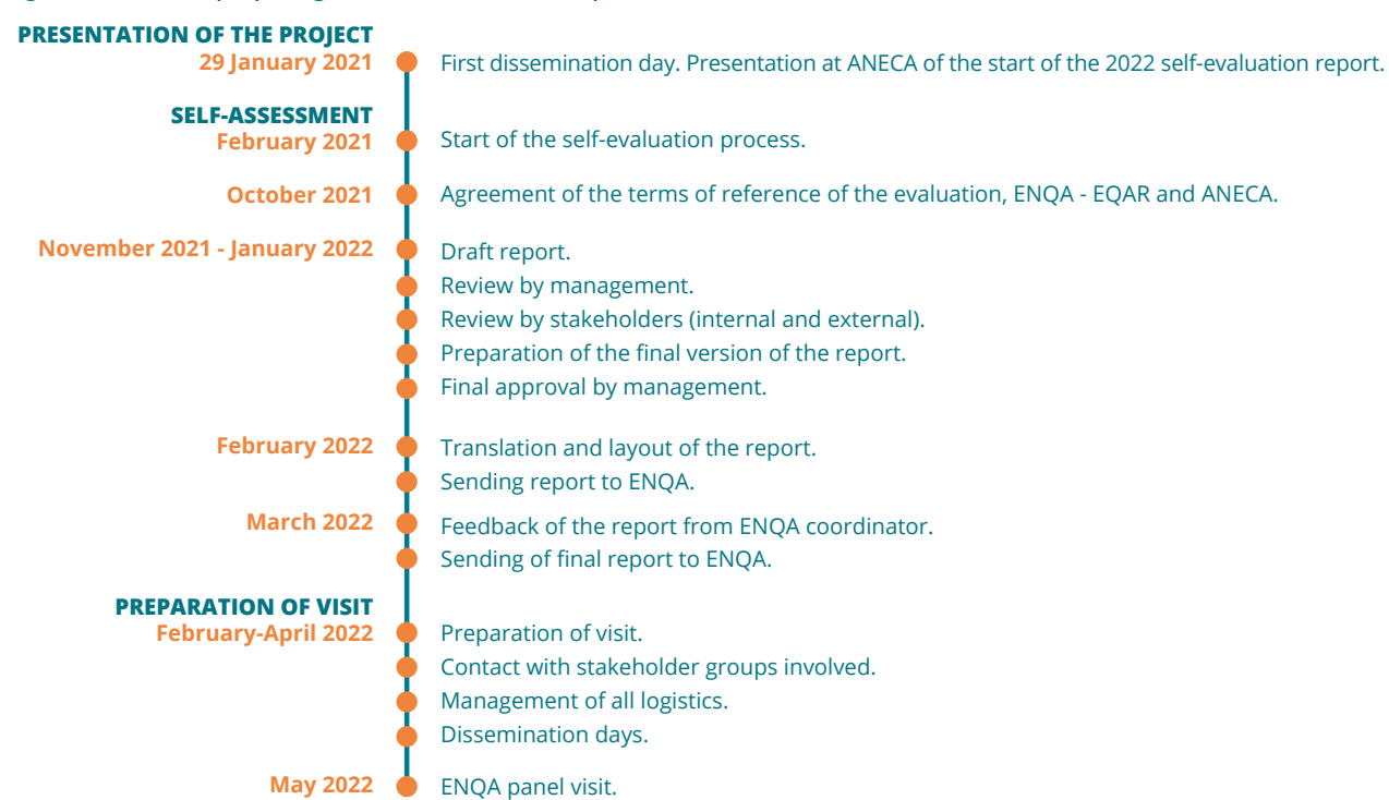
Figure 1. Phases in preparing the Self-Assessment Report.

Below, Figure 1 shows the timeline followed during the process of preparing the Self-Assessment Report.